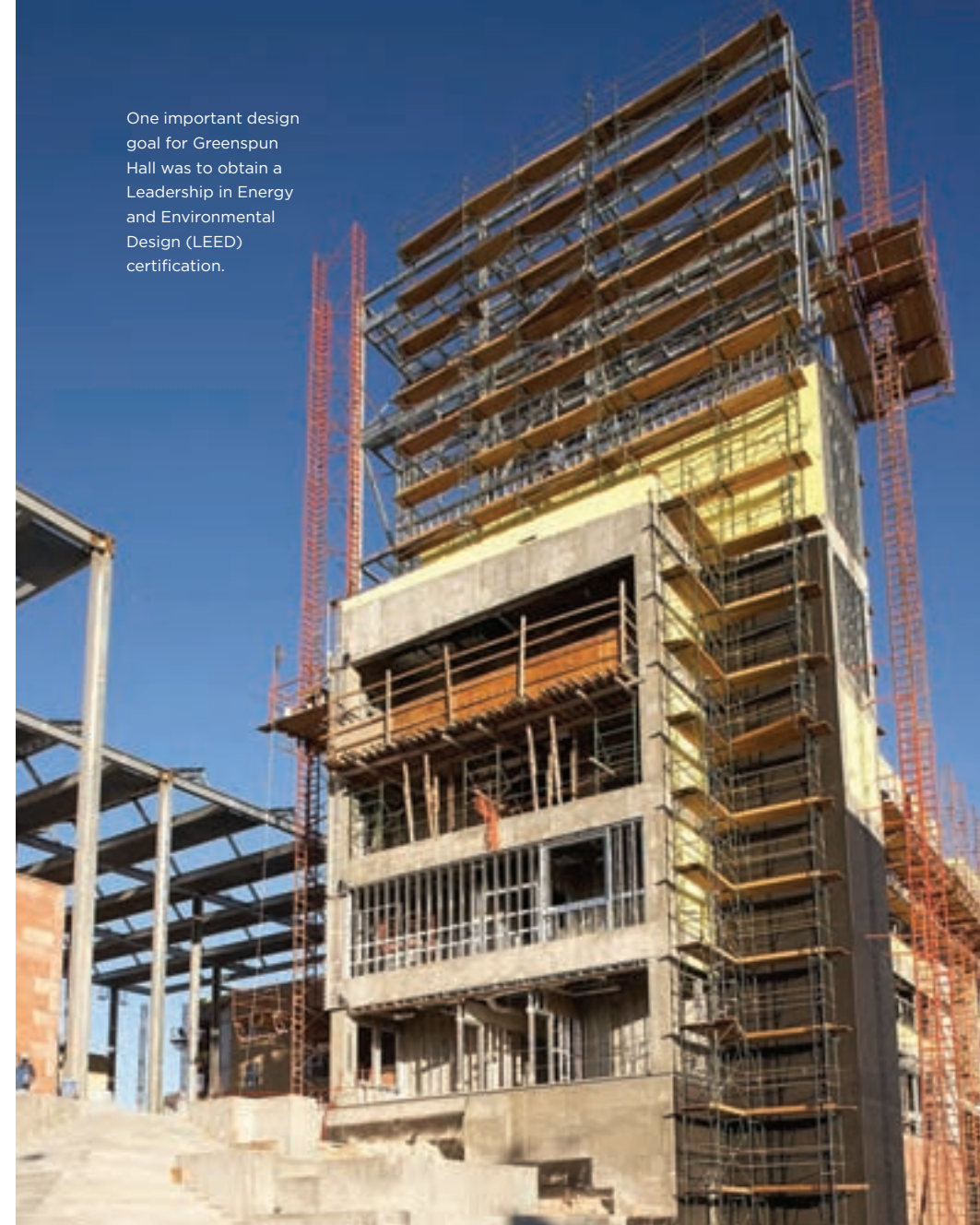
One important design goal for Greenspun Hall was to obtain a Leadership in Energy and Environmental Design (LEED) certification.